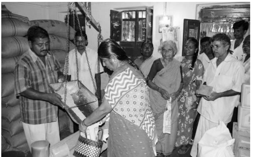
Fig.1 Existing method of Ration shop Consumable Distribution

In the existing system, works that embrace product distribution, card entry, product consideration, and products delivery area unit done manually by Federal Protective Service (Fair worth Shop) commission agent. The ration distribution system has drawbacks like inaccurate amount of goods, low process speed, giant waiting time, material stealing in ration looks [6].