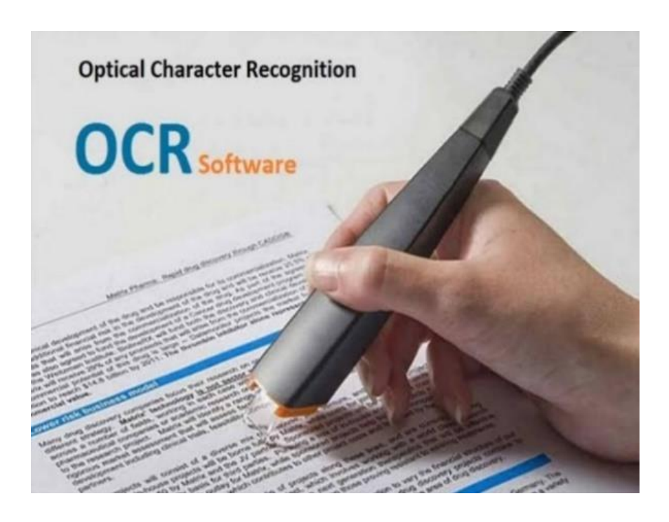
Fig 4 Optical Character Recognition (OCR)

OCR enables to convert previously prints text material into information. OCR requires a scanner and software .The basic process of OCR involves examining the test a document and translating the character into code that can be used for data processing .It is also referred to as text recognition OC R is using a scanner to process the physical form of a document .OCR software converts the document into two color or black and white version. The application of OCR is for automatic data entry, extraction processing and recognizing text such license plates with a camera or software.