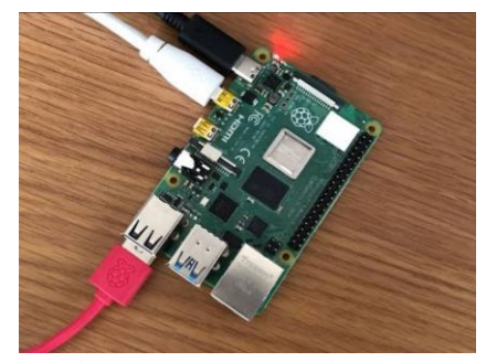
Fig 2 Raspberry pi

Here we are using sypder python software to implement a program in order to store and access the data of the visitors and the hardware Raspberry pi is used. The Raspberry pi is a low cost, credit- card sized computer that plugs into a computer monitor or TV, and uses a standard keyboard and mouse. It is capable little device that enables people of all ages to explore computing, and to learn to program in languages. An SD card inserted into the slot on the board acts as the hard drive for the Raspberry pi. It is powered by USB and the video output can be hooked up to a traditional RCA TV set, a more modern monitor ,or even a TV using the HDMI port widely uses such as for weather monitoring because of its low cost, modularity and open design .