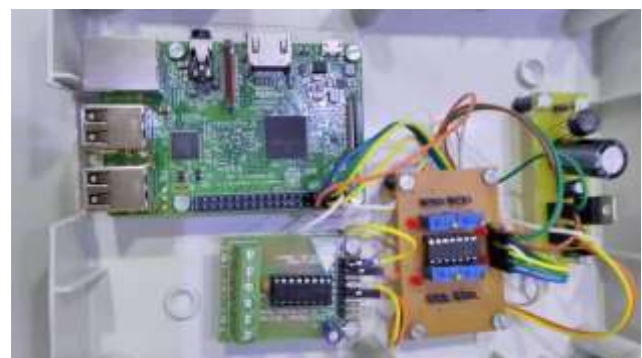
Fig 3:Implementation of system