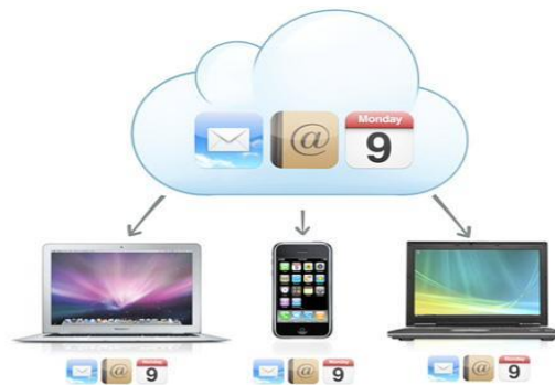
Fig 1 Mobile- Cloud Environment

Framework: cloud computing systems actually can be considered as a collection of different services, thus the framework of cloud computing is divided into three layers, which are infrastructure layer, platform layer, and application layer (see Fig 1)